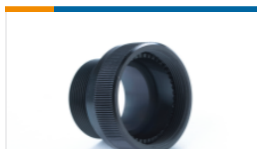
TE Model / Part #Y5015-000000078019 STRAIGHT ADAPTER HEATSHRINK - TYPE SCHA