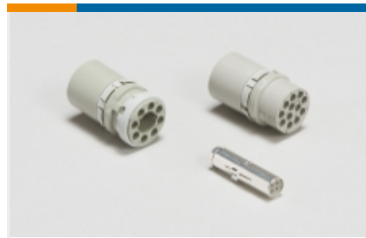
Circular Connector Contact Inserts(5)