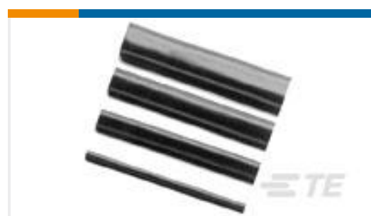
TE Model / Part #CB5385-000 SST-48-20/FR/97