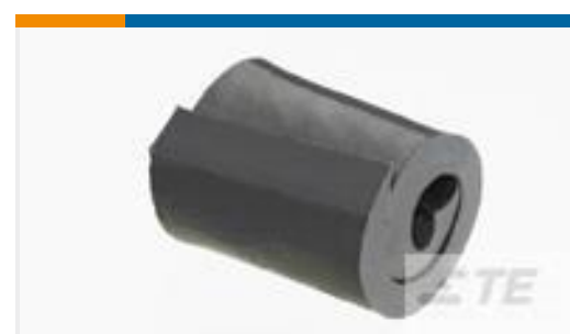
TE Model / Part #CS9490-000 SEB-A