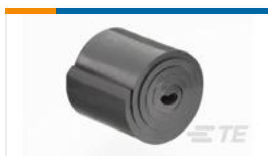
TE Model / Part #CS9494-000 SEB-E