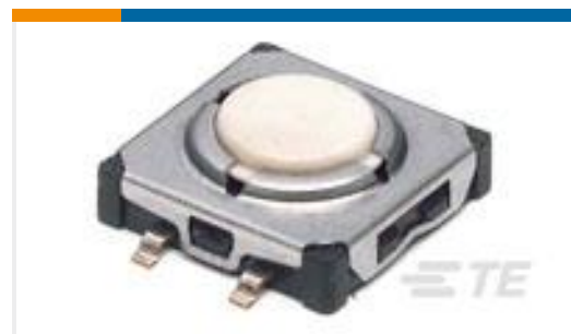
TE Model / Part #1571218-3 TACT,SMT,12X12,SEALED,T&R